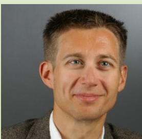
Dr. Oliver Amft

The project will consider real validation cases with at least 1.000 devices deployed in living lab buildings. Public buildings, such as offices, universities, hotels, and shops will be considered. With its multi-national consortium, the project's outreach will go beyond European borders.